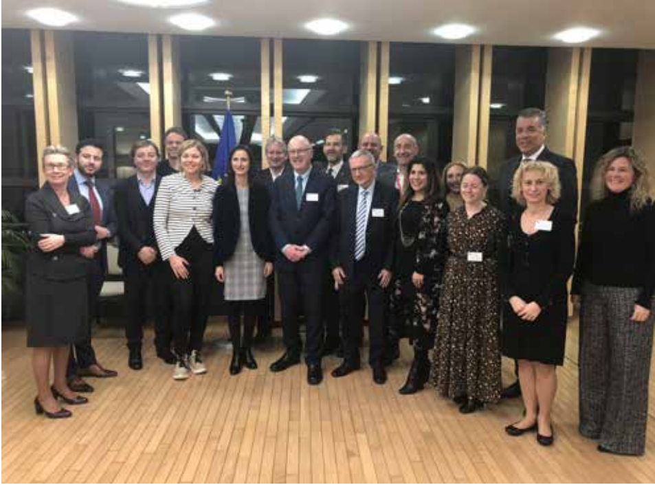
European Innovation Council pilot Advisory Board members with Commissioner Mariya Gabriel and Members of the European Parliament